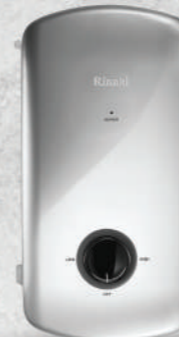
Liquid Silver (SL)