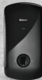
Diamond Black (BL)