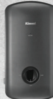
Space Grey (G)